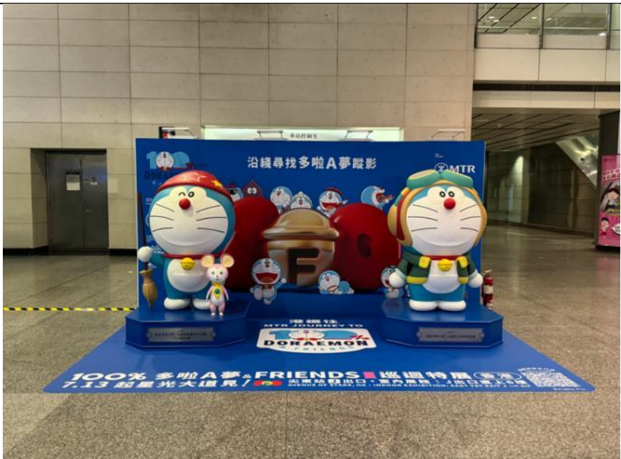
(Left) Doraemon the Movie: Nobita's New Great Adventure into the Underworld (2007) ; (Right) Doraemon the Movie: Nobita's Sky Utopia (2023)

5 Hong Kong Station Airport Express Lobby