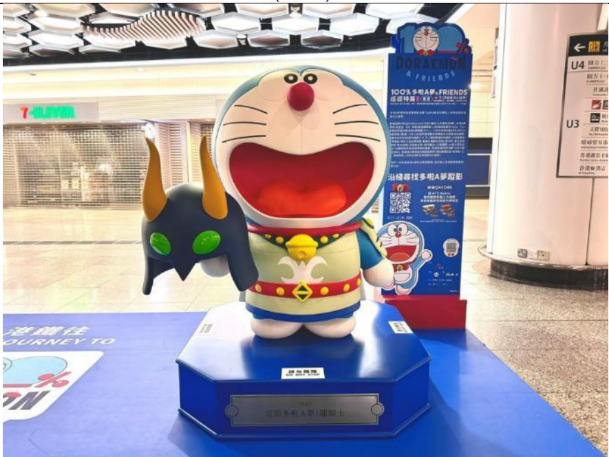
Doraemon the Movie: Nobita and the Knights on Dinosaurs (1987)