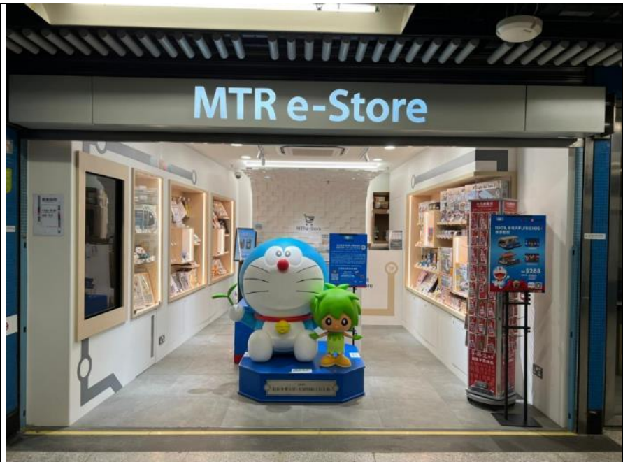
Doraemon the Movie: Nobita and The Giant's Legend of Green Planet (2008)