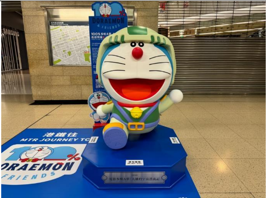
Doraemon the Movie: Nobita's Drifts in the Universe (1999)