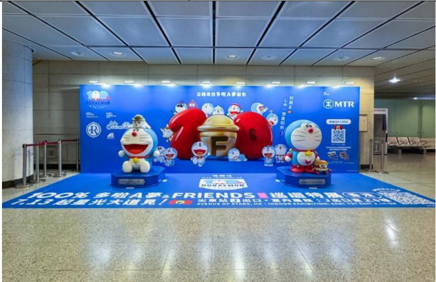
(Left) Doraemon the Movie: Nobita in the New Haunts of Evil- Peko and the Five Explorers (2014) ; (Right) Doraemon the Movie: Nobita's Space Heroes (2015)